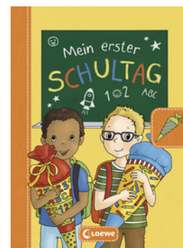
My First Day at School - Boys