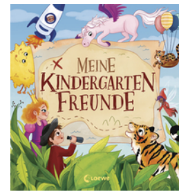
My Kindergarten Friends - Magical Creatures, Animals & Co.