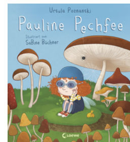
Pauline the Flop-Fairy