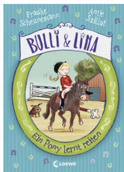
Bulli and Lina - A Pony Learns to Ride (Vol. 2)