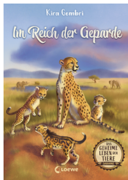
The Secret Life of Animals - Realm of the Cheetahs (Vol. 3, Savannah)