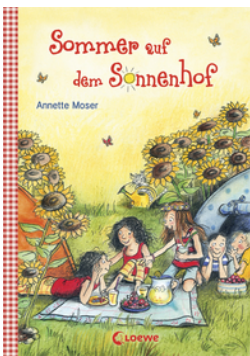
Sunny Farm – Summer on Sunny Farm (Vol. 2)