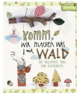
Let's Make Something with Wood