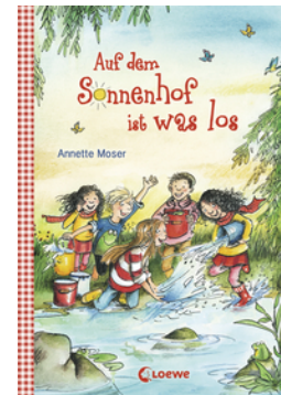
Sunny Farm – Something's up on Sunny Farm (Vol. 3)