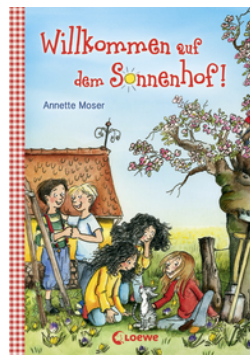
Sunny Farm – Welcome to Sunny Farm! (Vol. 1)