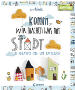
Let's Make Something in Town