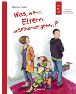
If My Parents Are Divorced: How to Talk about Separation, Divorce, and Breakups