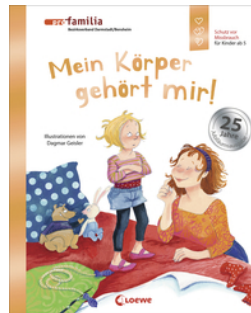
My Body Belongs to Me from My Head to My Toes - Jubilee Edition