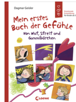
My First Book of Feelings