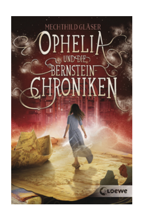
Ophelia and the Amber Chronicles