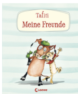
My Friends - Tafiti