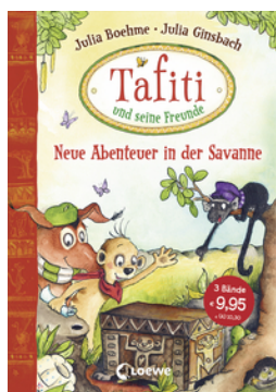
Tafiti and His Friends - New Adventures in the Savannah (Vol. 4-6)