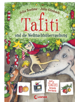
Tafiti - The Christmas Surprise