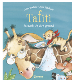
Tafiti – That’s How You Get Well