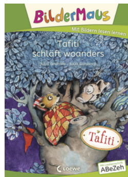
Picture Mouse - Tafiti Sleeps Somewhere Else