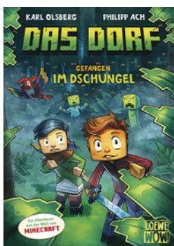
The Villagers - Trapped in the Jungle (Vol. 3)