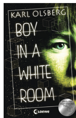
Boy in a White Room