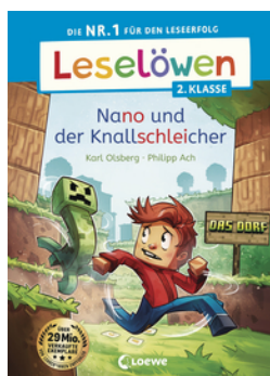
Reading Lions (Year 2) – Nano and the Creeper