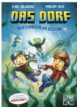
The Villagers - Sunk in the Ocean (Vol. 5)