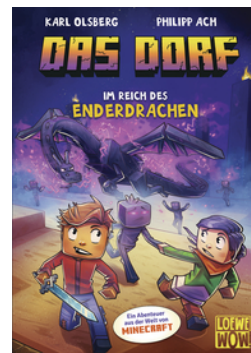
The Villagers - In the Empire of the Enderdragon (Vol. 4)