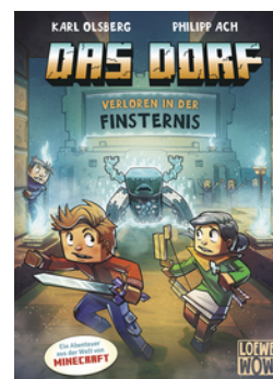
The Villagers - Lost in the Darkness (Vol. 6)