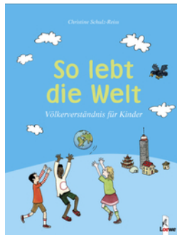
How The World Lives