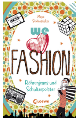
We Love Fashion - Drainpipe Jeans and Shoulder Pads (Vol. 1)