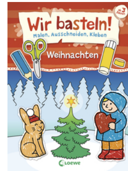
Let's Do Arts & Crafts! - Christmas