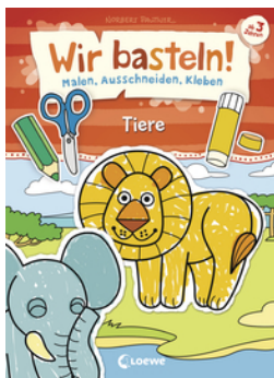
Let's Do Arts and Crafts! - Animals