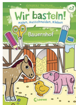
Let's Do Arts and Crafts! - Farm