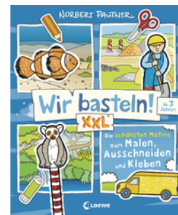
Let's Do Arts & Crafts! XXL - The most beautiful designs to paint, cut out and glue (blue)