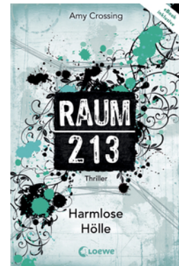
Room 213 – Harmless Hell