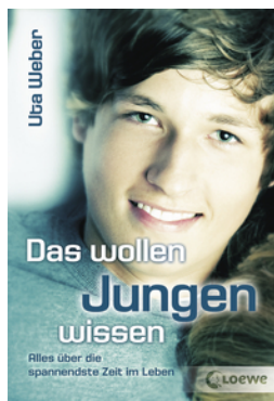
All Boys Want to Know – Facts about the Most Exciting Time of Life