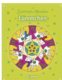
Enchanting Mandalas: Lambkins