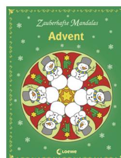
Enchanting Mandalas: Advent