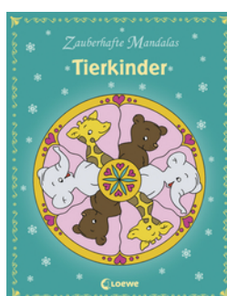
Enchanting Mandalas: Baby animals