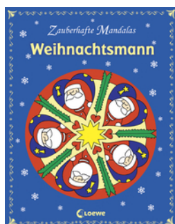
Enchanting Mandalas - Father Christmas