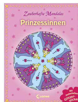
Magical Mandalas Princesses