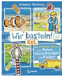
Let's Do Arts & Crafts! XXL - The most beautiful designs to paint, cut out and glue (blue)