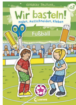
Let's Do Arts and Crafts! - Football