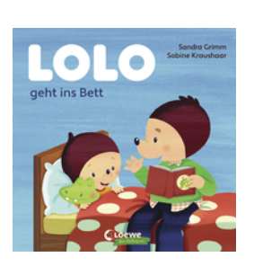
Lolo Goes to Bed