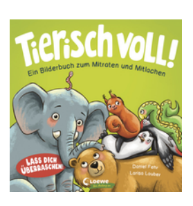
Can You Fit In The Animals?