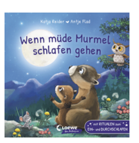
When Tired Marmots Go to Sleep