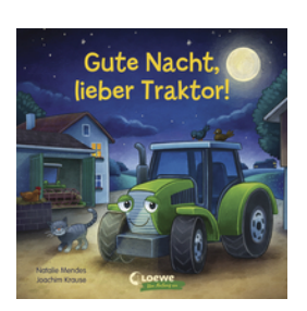
Good Night, Dear Tractor!