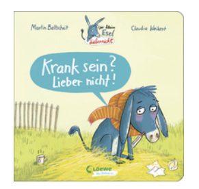
Little Donkey No-Never-Ever -Being Sick