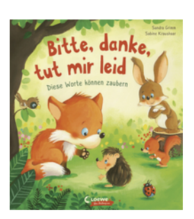
Please, Thank You, I'm Sorry!