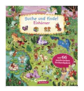
SEARCH AND FIND! -Unicorns