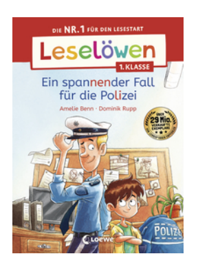
Reading Lions (Year 1) - An Exciting Case for the Police