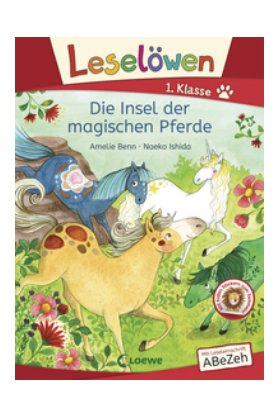
Reading Lions Year 1 - The Island of Magical Horses