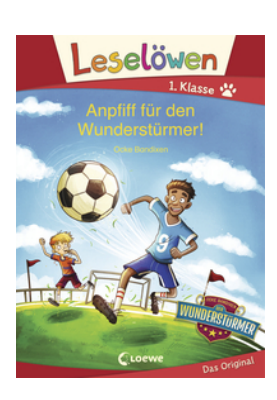
Reading Lions Year 1 - Kick-off for the Ace Striker!