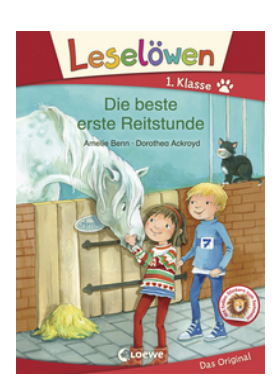
The Best First Riding Lesson