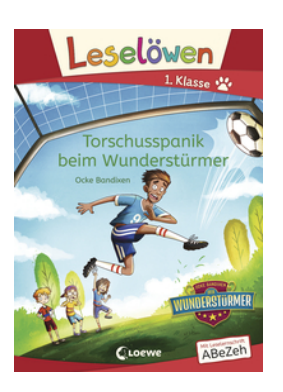
Ace Striker in Goal-Scoring Panic