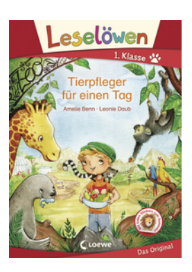
Zoo Keeper for a Day