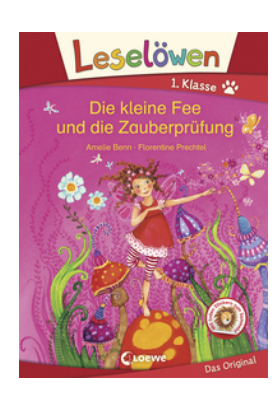
The Little Fairy and the Magic Exam