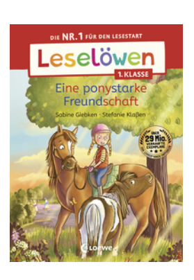
Reading Lions (Year 1) - A Pony-Strong Friendship