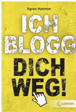
I'll Blog You Away!