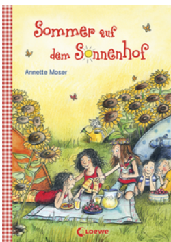
Sunny Farm – Summer on Sunny Farm (Vol. 2)