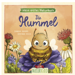
My First Naturebook – The Bumblebee