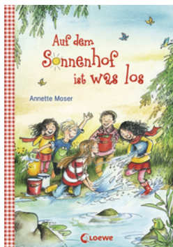
Sunny Farm – Something's up on Sunny Farm (Vol. 3)