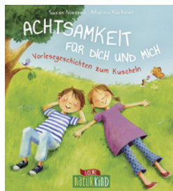
Attentiveness for All of Us! – Story Time is Cuddle Time!