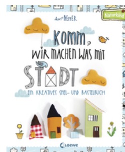
Let's Make Something in Town