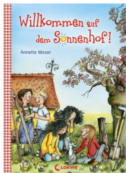
Sunny Farm – Welcome to Sunny Farm! (Vol. 1)