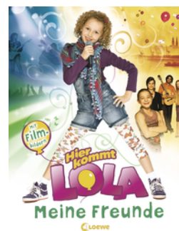
Here Comes Lola! My Best Friends