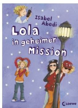
Lola's Secret Mission (Vol. 3)