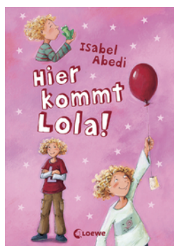
Here Comes Lola! (Vol. 1)