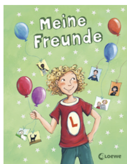
My Best Friends