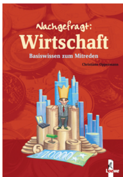
Guide to Economics