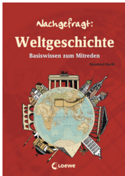
Guide to World History