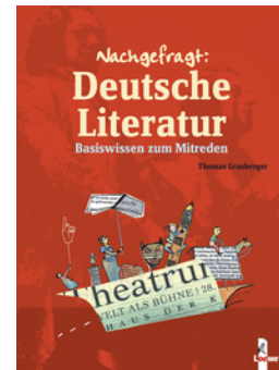
Guide to German Literature